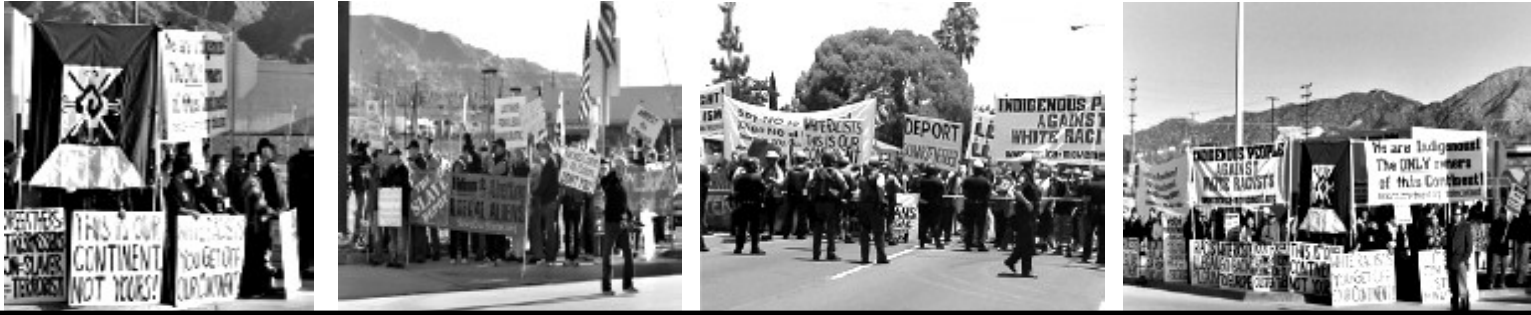
Mexica Movement Protesting in Baldwin Park, Glendale, and Burbank 2005-2006 against the Minutemen, SOS, and other racists.